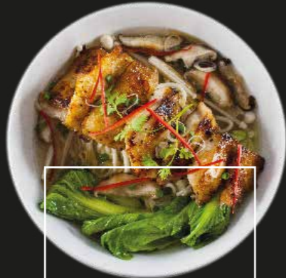
DIGBY'S TIGER GROUPER FISH Noodle / Soup / Bor bor - $9.50 -