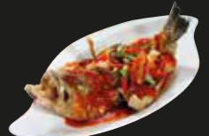
GROUPEL FISH Choice: Soup / Fried