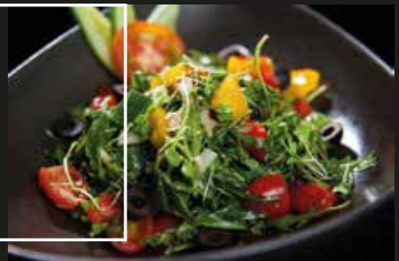
ORGANIC ROQUETTE - $9.00 -