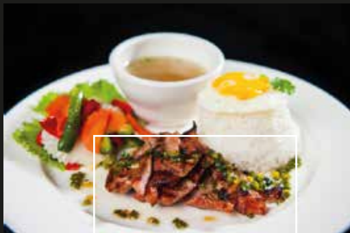
GRILLED PORK with rice - $6.50 -