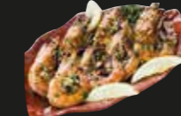
PAN FRIED GARLIC BUTTER PRAWNS