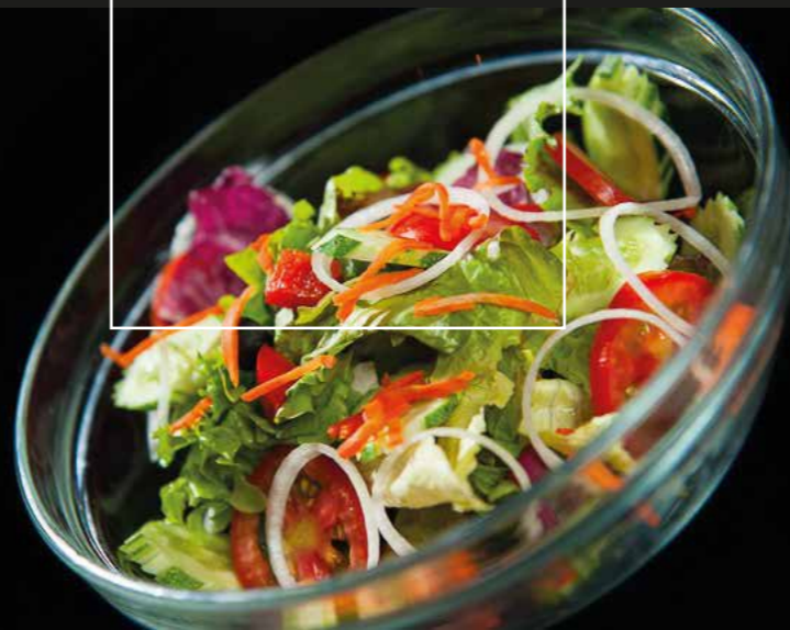
HOUSE GARDEN SALAD with Goma Sauce - $6.50 -