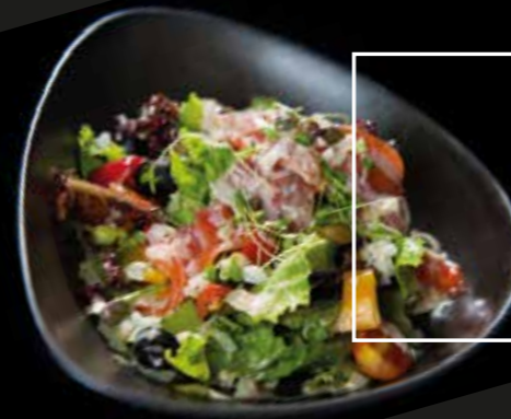
SMOKED SALMON SALAD - $9.50 -