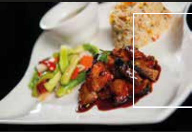
SINGAPORE CHAR SIEW - $6.50 -