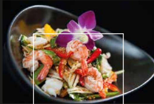
ASIAN MANGO SEAFOOD SALAD S: $5.50 L: $7.50