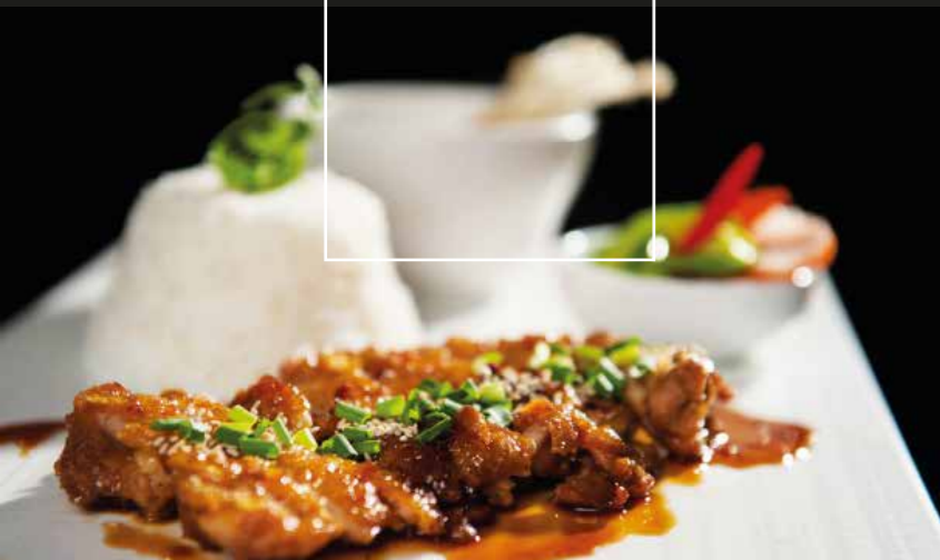
TERIYAKI CHICKEN - $6.50 -