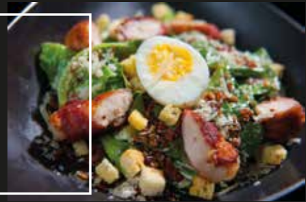
CAESAR SALAD - $7.50 - with chicken bacon - $9.50 -