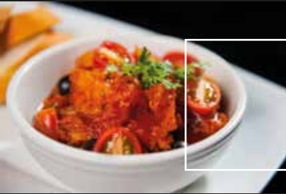
GROUPER STEW with fish S: $10.00 L: $15.00