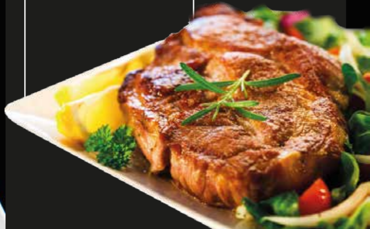
GRILLED PORK CHOP with french fries and salad - $9.50 -