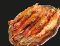
GRILLED FRESH PRAWNS