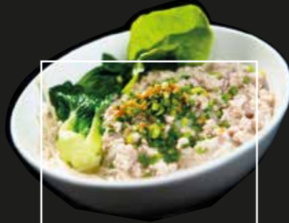
DIGBY'S PORK KWAY TEOW Soup or Dry - $5.50 - Seafood/Beef - $6.50 -