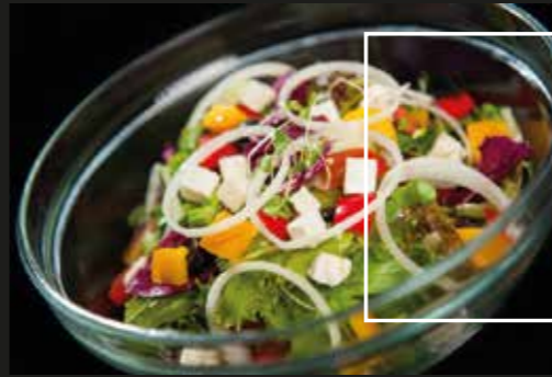
GREEK SALAD - $7.50 -